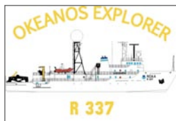
BALLCAPS AND LEFT CHEST ON POLOS