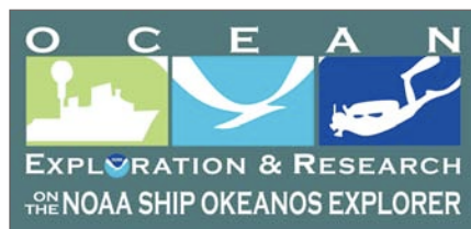
GARMENT FRONT ACROSS CHEST